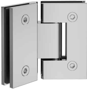
Finish: Polished Chrome Code: GFH135-CH