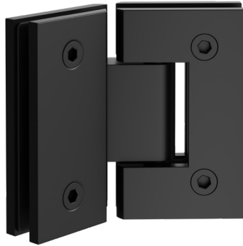
Finish: Matte Black Code: GFH135-MB