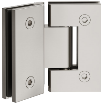
Finish: Brushed Nickel Code: GFH135-BN