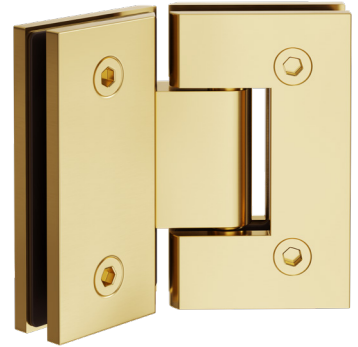
Finish: Brushed Brass Code: GFH135-BB