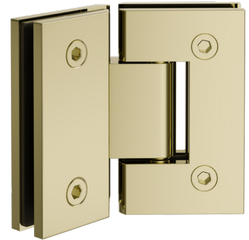
Finish: Champagne Gold Code: GFH135-CG