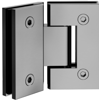
Finish: Gunmetal Code: GFH135-GM