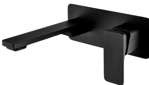
Matte Black EV130-MB