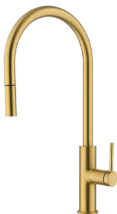
Brushed Brass 8020058-BB