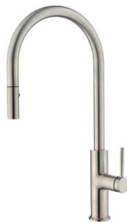
Brushed Nickel 8020058-BN