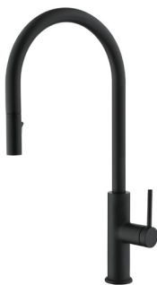
Matte Black 8020058-MB