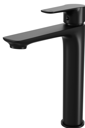
Matte Black ED110-MB