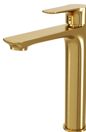
Brushed Brass ED110-BB