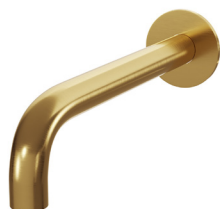
Brushed Brass SP090-220-BB