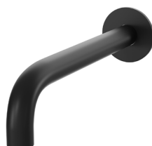
Matte Black SP090-220-MB