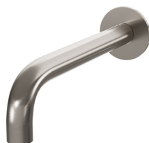
Brushed Nickel SP090-220-BN