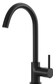
Matte Black SP120-MB