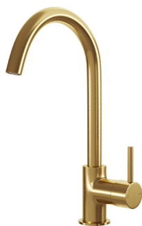
Brushed Brass SP120-BB