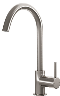
Brushed Nickel SP120-BN