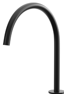
Matte Black SP125-MB