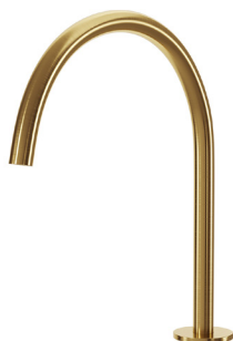
Brushed Brass SP125-BB