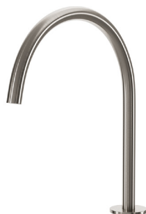
Brushed Nickel SP125-BN