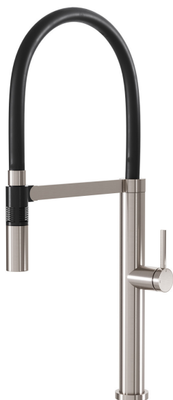
Brushed Nickel SPD120-BN

CONGRATULATIONS ON THE PURCHASE OF YOUR NEW CASA LUSSO TAPWARE, WE HOPE YOU AND YOUR FAMILY ENJOY YOUR NEW PRODUCT AND CONSIDER US FOR ANY FUTURE PROJECT. CASA LUSSO PRODUCTS HAVE BEEN MANUFACTURED UNDER THE HIGHEST STANDARDS OF QUALITY AND WORKMANSHIP