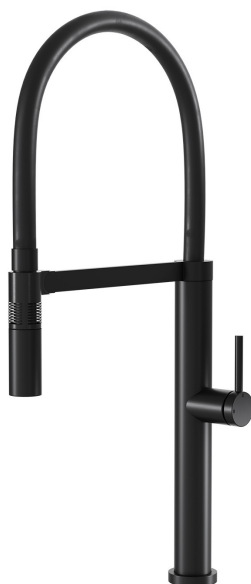
Matte Black SPD120-MB